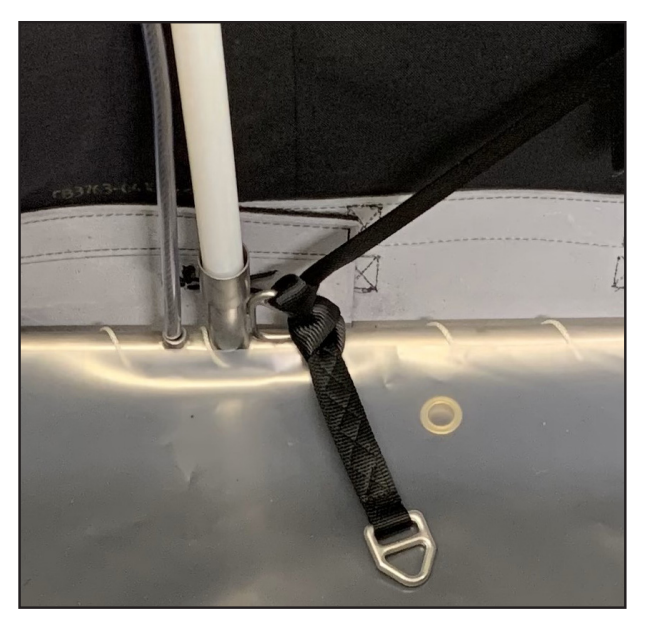
Restraint anchor attached to bottom frame.

The pilot restraint anchor is located at the lower D-ring on the long side of the basket. The anchor is secured via a larks head knot and is positioned below the cross-brace strap attachment.