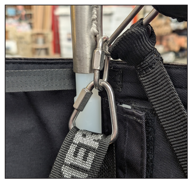
Harness top frame attachment