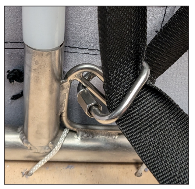
Harness bottom frame attachment